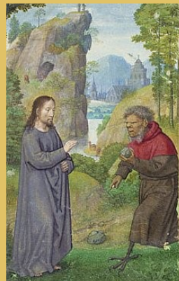
Jesus being tempted in desert by Satan.