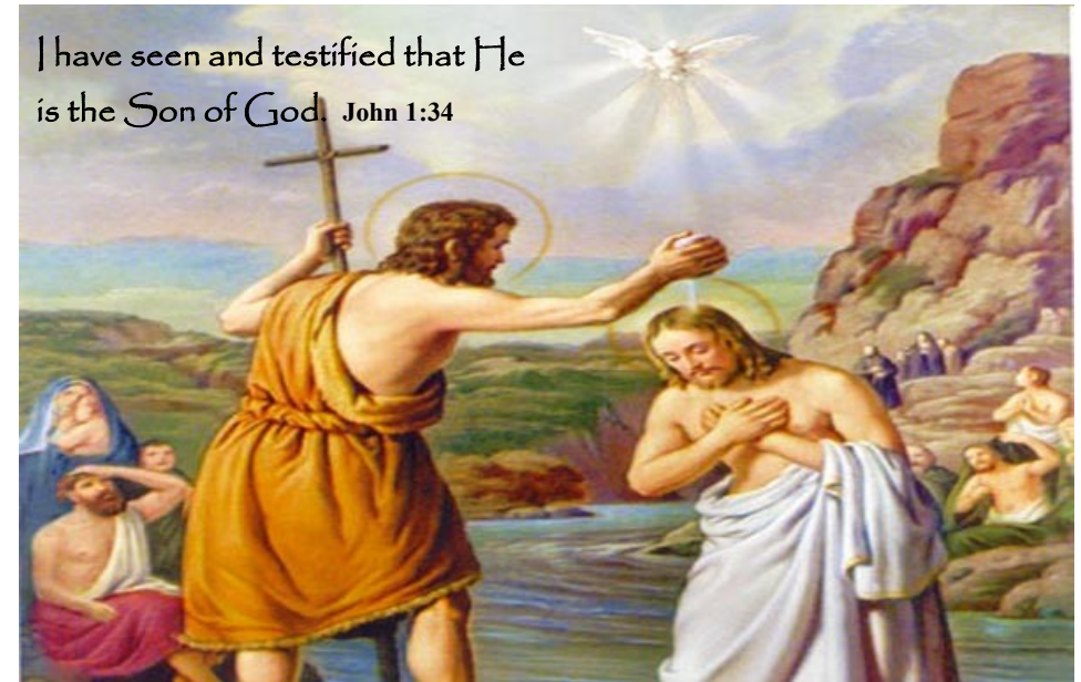
I have seen and testified that He is the Son of God. John 1:34